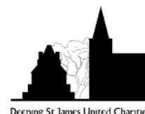
Deeping St James United Charities

In addition, they can also offer counselling sessions with Citizens Advice if you need some help or advice on a matter.