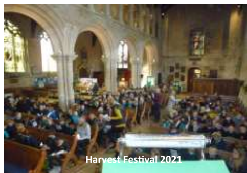
Harvest Festival 2021