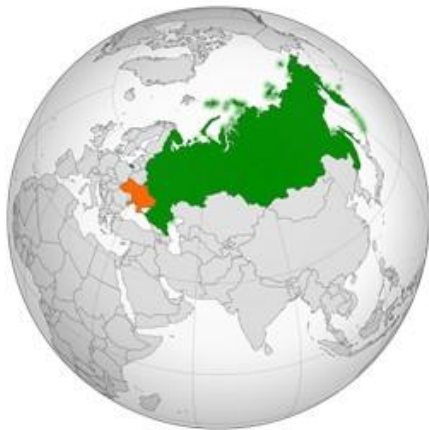
Pictured above: Ukraine in orange and Russia in Green

Countries who share a border with Ukraine have been preparing for the arrival of refugees. Maia Sandu, Moldova's president said she was prepared to help Ukrainian refugees. Slovakia, Hungary and Poland have also said they are ready to welcome refugees and are sending extra troops to manage people arriving at crossings set up on their borders with Ukraine.