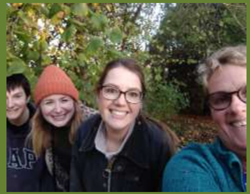
November's Groundforce Team

Thank you so much for the support we have already been given with time and the donation of resources from our wish list. We want to develop an outside art area, a mud kitchen, a balance/ exploration zone, fire safety zones, base camps, quiet areas with hammocks and much, much more.